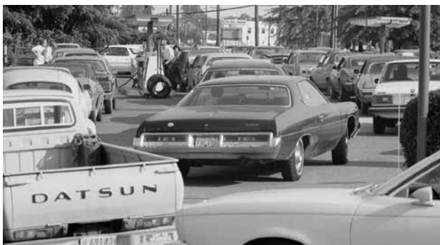
United States' support of Israel during the Arab-Israeli War led to an oil embargo. As a result, Americans experienced a gasoline shortage that led to rationing and an economic crisis relating to high prices, 1973.

Consider the history of the Middle East. One example was the creation of the State of Israel in 1948. How were diplomatic relationships carried out in the area? What role did the United States and Great Britain play? What were the long-term consequences for Israel? For diplomacy in the region? Or, students might be curious about the 1973 Arab-Israeli War and subsequent peace negotiations. What happened, and how did it impact the United States and other nations? What effect did these diplomatic relations have on the world economy?