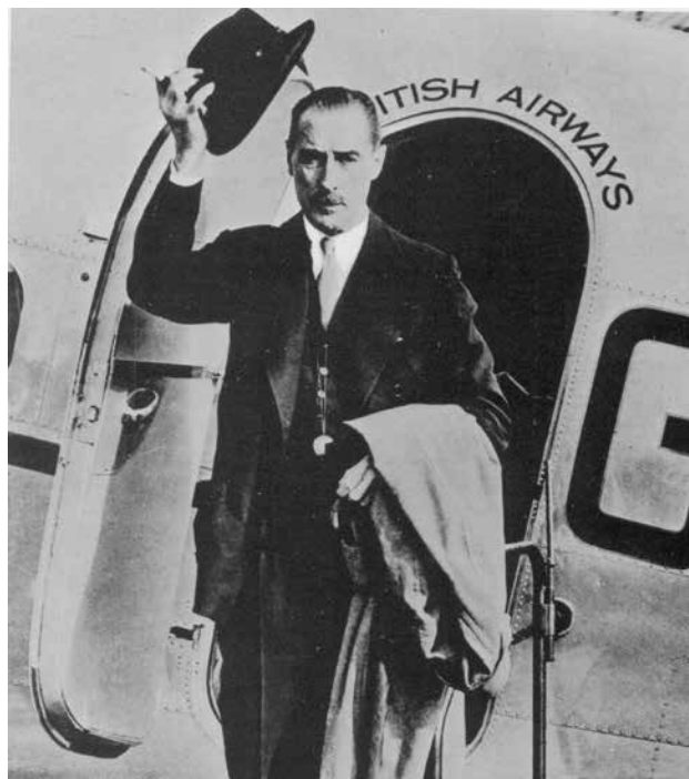
Neville Henderson, the British Ambassador to Germany, departing Croydon Airport to fly to Berlin, Germany, August 1939.

Others might look at how New Zealand established itself as a diplomatic force during World War II and its active involvement in building the United Nations (1945). Before World War II, New Zealand maintained only one foreign outpost in London, England. What changed for New Zealand? What new alliances did New Zealand establish? How did treaties involving New Zealand, such as the ANZUS (Australia, New Zealand, United States) Defence Treaty in 1951 and SEATO (Southeast Asia Treaty Organization) in 1954, influence New Zealand's status as a world power? Why did New Zealand seek to establish relationships with the United States, Canada, and Asian countries?