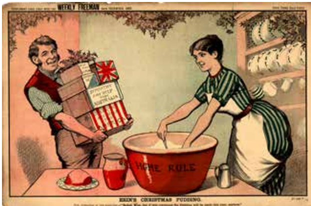
Erin's Christmas Pudding appeared in the December 24, 1887, issue of the Weekly Freeman magazine and showed international support to Ireland and the concept of Home Rule.

Think about how countries have interacted with each other. For instance, students might explore the heated debate between Ireland and Great Britain over the concept of Home Rule (1870–1919). Why was self-government important to the Irish? What debates occurred between Ireland and Great Britain due to this political movement? Did the debates lead to diplomacy on both sides? How was this debate viewed internationally? What were the short-term and long-term consequences?