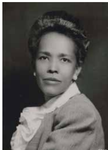
Ella Baker served as an activist from the 1930s to 1980s, working in several major organizations. Her papers are archived at the New York Public Library's Schomburg Center for Research in Black Culture.

Students interested in civil rights might investigate the role women played in the movement. Consider debates that occurred between African American women and their male counterparts. How did this affect and shape the movement? For instance, Ella Baker, a major proponent of the Civil Rights Movement, fought sexism in both the National Association for the Advancement of Colored People (NAACP) and the Southern Christian Leadership Conference (SCLC). 1 What were the results of these debates? Baker eventually left to help organize and advise the Student Nonviolent Coordinating Committee (SNCC). What influence did she have on the Civil Rights Movement?